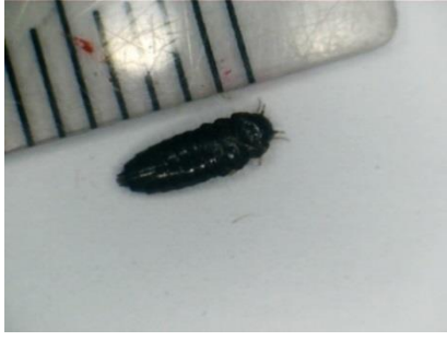
Figure 2: Larvae found in bark (borer insect)