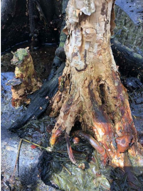
Figure 8: Symptoms of root rot in Bruguiera cylindrica – Kelaa