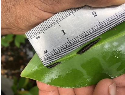
Figure 1: Larvae found in water (likely aquatic fly)