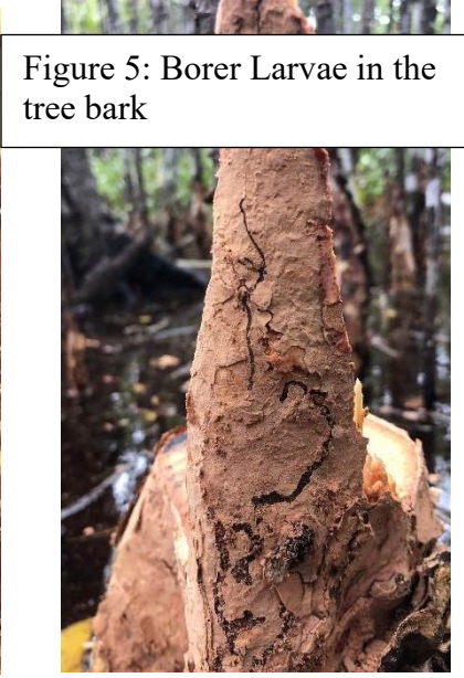
Figure 5: Borer Larvae in the tree bark