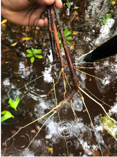
Figure 7: Symptoms of root rot in Bruguiera cylindrica – Kelaa