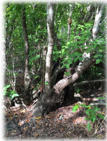
Image6: Maru trees in Neykurendhoo