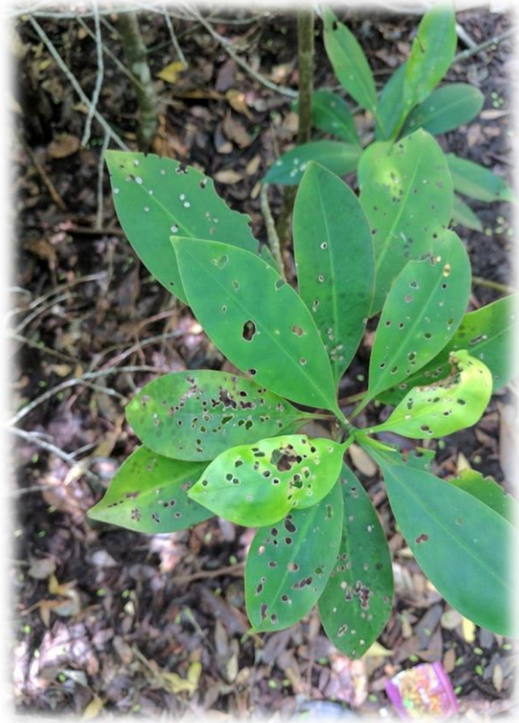
Image5 : Plants infected by disease