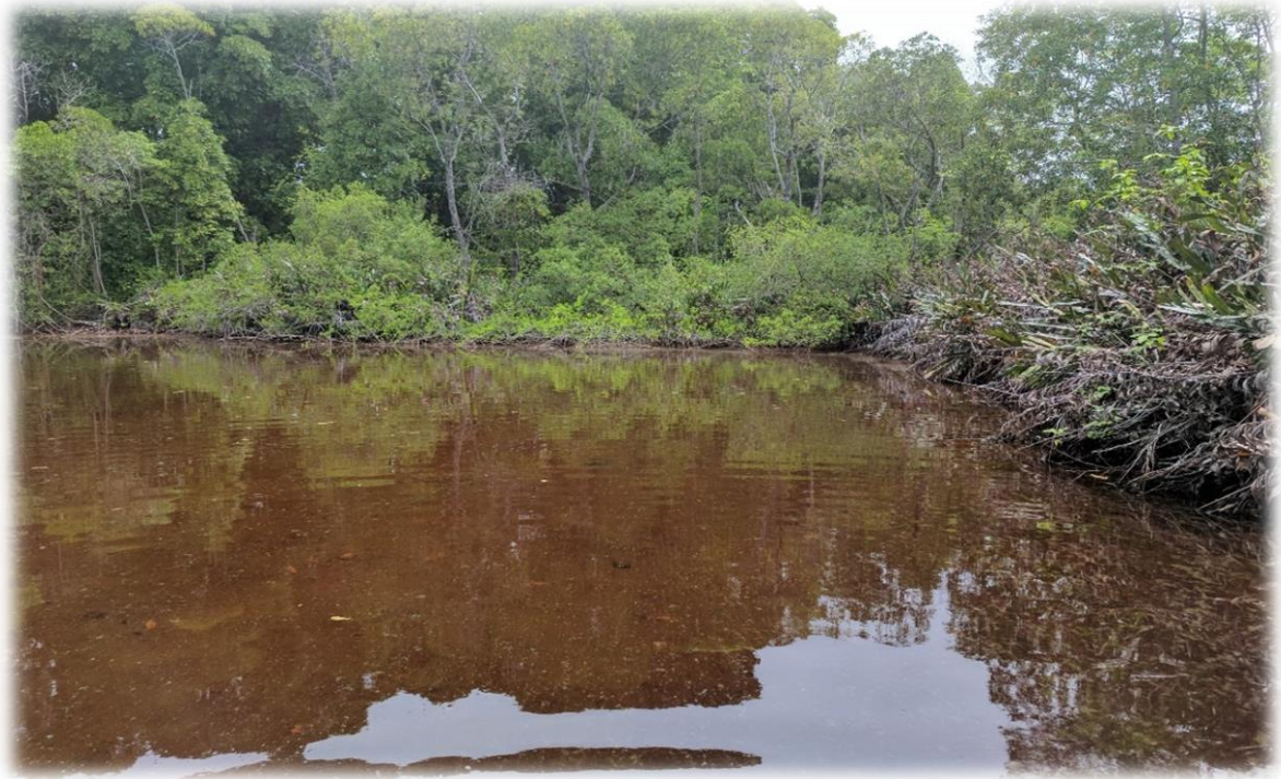
Image3 : "Kuda fengandu" wetland