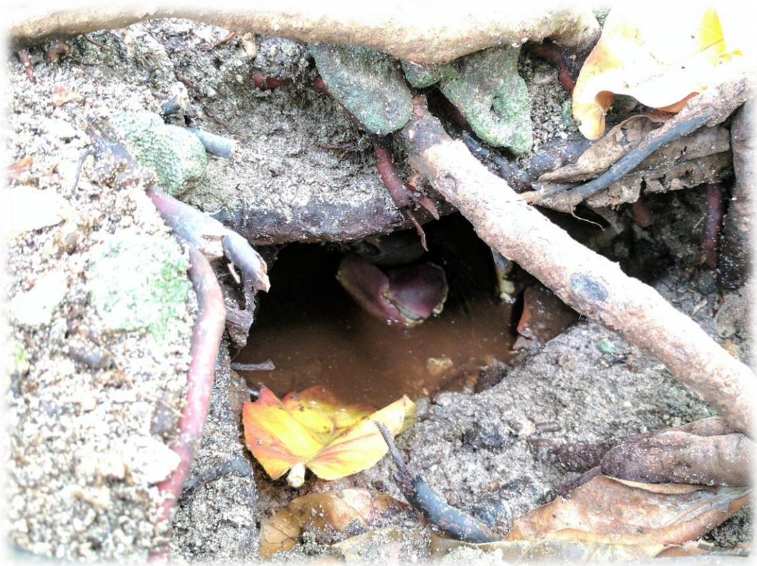
Image4 : Mangrove crab in Neykurendhoo