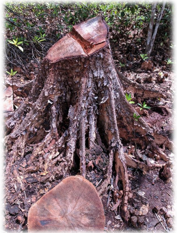
Image2 : Huge Mangrove trees cut down for their timber