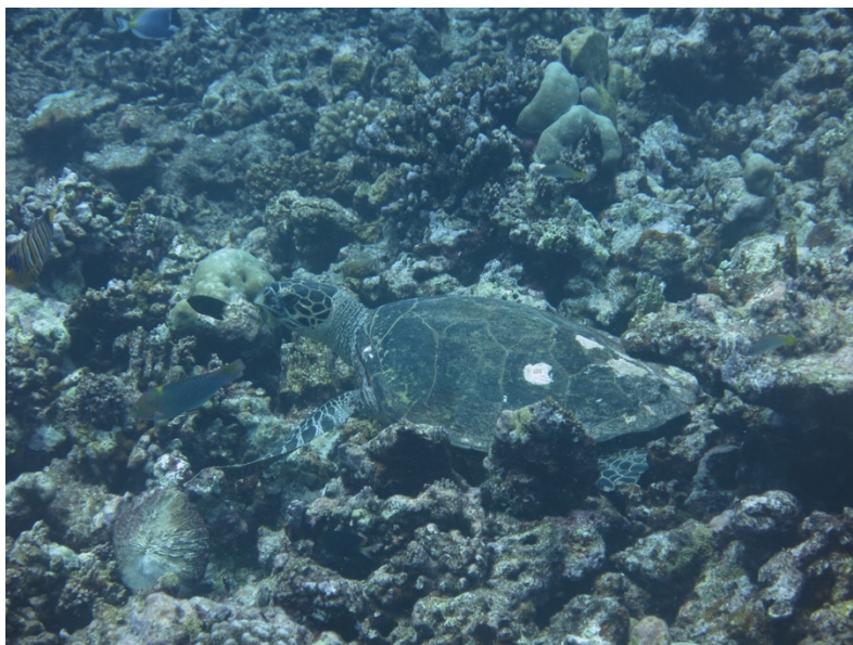
Figure 3. An Endangered hawksbill turtle laying on the benthos in Farukolhu

These species are under threat and identifying and protecting habitat where they are found is key to their survival. Complex reef flats and slopes are foraging grounds for reef sharks and provide shelter spaces for large groupers. Endangered hawksbill turtles are relatively common in the Maldives; however, their populations are at risk from a decline in available nesting sites and the declining health of coral reefs.