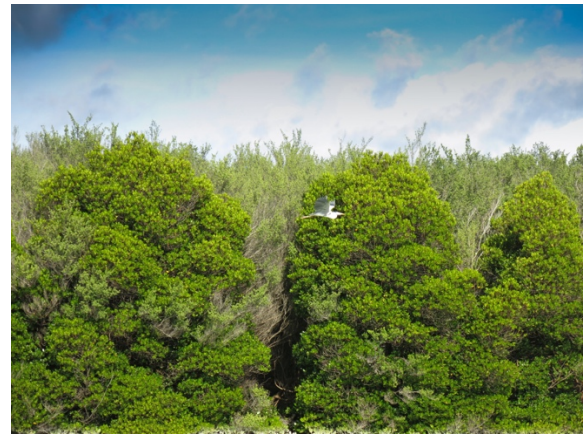
Figure 9. A Grey Heron flying on top of the mangrove trees

A high number of birds were observed across the island. The bird species observed differed between survey zones. Birds were most abundant in the mangrove bay habitat. This might be due to the abundance of potential prey, including gastropods and small fish. Surveys were limited to daylight hours, so no roosting was observed, and we were unable to determine the location of any nesting sites.