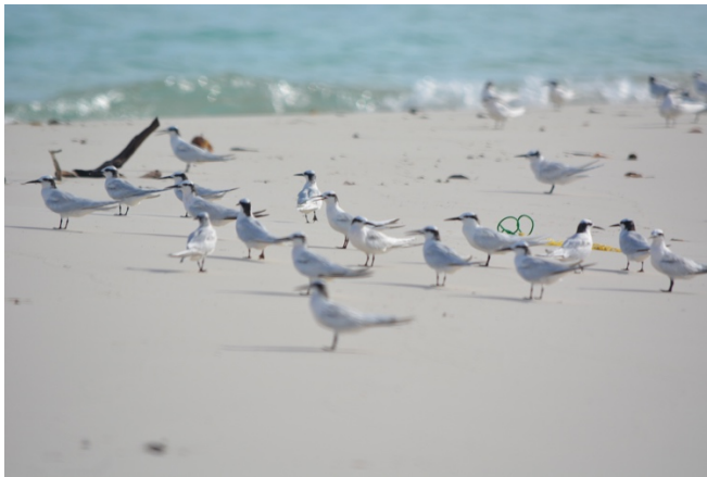
Figure 8. A flock of black Naoed Tern