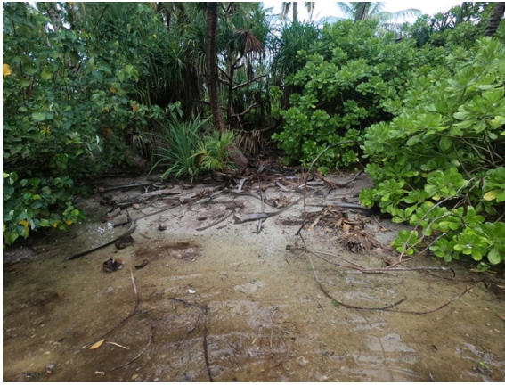
Figure 4. Shoreline vegetation of Farukolhu