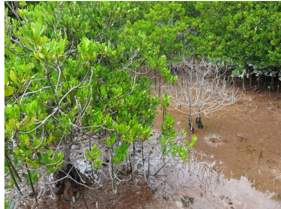
Figure 7. Bruguier sp.

The coastal fringe facing the inner atoll was dominated by S. taccada , T. tiliaceum and Guettarda speciosa . Here the vegetation line is far from the high-water line, behind a sandy beach. P. scidula dominated on outer edge where there was a rocky shore and the high-water line reached the vegetation edge. The pond fringe areas were also dominated by these species, though there were also patches of Pandanus tectorius . The ponds in the north which were connected to the sea by channels at high tide had stands of R. mucronata . The mangrove bay was dominated by C. tegal , with stands of R. mucronata . The width of mangrove growth was very narrow, usually only a single tree deep. Though seedling density was not recorded, there was evidence of significant juvenile growth, an indicator of a healthy community.