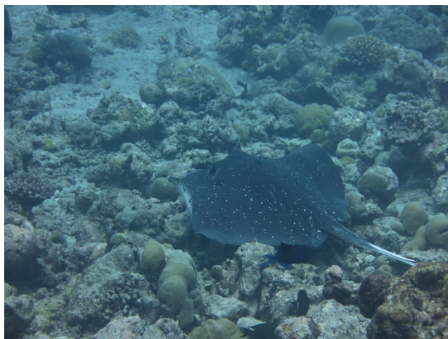
Figure 1. A sting ray hovering on top of the benthic habitat of Farukolhu

Two sites were surveyed using quantitative transect methods (Table 1). The substrate of the reefs surveyed was predominantly rock, rubble and sand. This characterised the inner and northern fringing reef. However, environmental conditions prevented detailed surveys of the outer reef which rapid surveys indicated had higher coral cover than those reported here. The mean coral cover of 14% was below the average observed during the ecological surveys. Algal cover was very low. The highest coral cover was found on the northern channel reef (16.7%). Structural complexity was low at survey sites with a mean of 1.2 for the reefs.