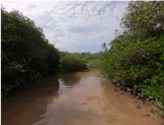
Figure 6. Mangrove vegetation