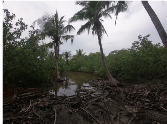
Figure 5. Island vegetation