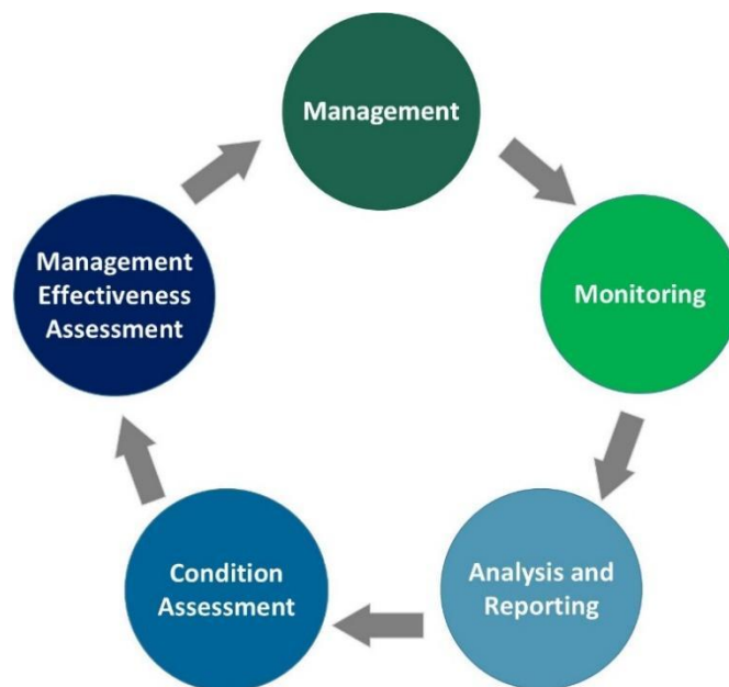
Figure 1. PCA monitoring within a cycle of adaptive management.

Marine Protected Areas are crucial for preserving biodiversity and promoting sustainable use of marine resources. When effectively managed, these areas contribute to healthier ecosystems by protecting habitats and endangered species, which in turn supports more robust fisheries. These improved environmental conditions provide numerous benefits to local communities, including enhanced food security through sustainable fishing practices and increased income opportunities from eco-tourism. By attracting visitors who are interested in exploring pristine marine environments, well-managed MPAs can also boost local economies and encourage conservation efforts.